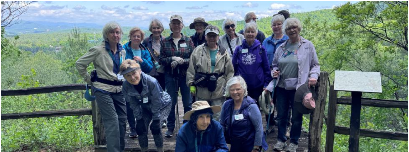
Givens Highland Farms and Givens Estates Hiking Groups meeting up for a day on the trail.