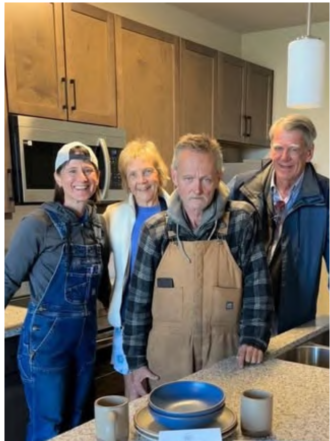
New Lady Gloria Ridge Tenant and Staff.

Haywood Street Community Development was formed in 2020 to develop affordable housing connected to existing Haywood Street ministries and programs already in service. Givens Communities is a partner with Haywood Street Community Development and manages the affordable apartments.