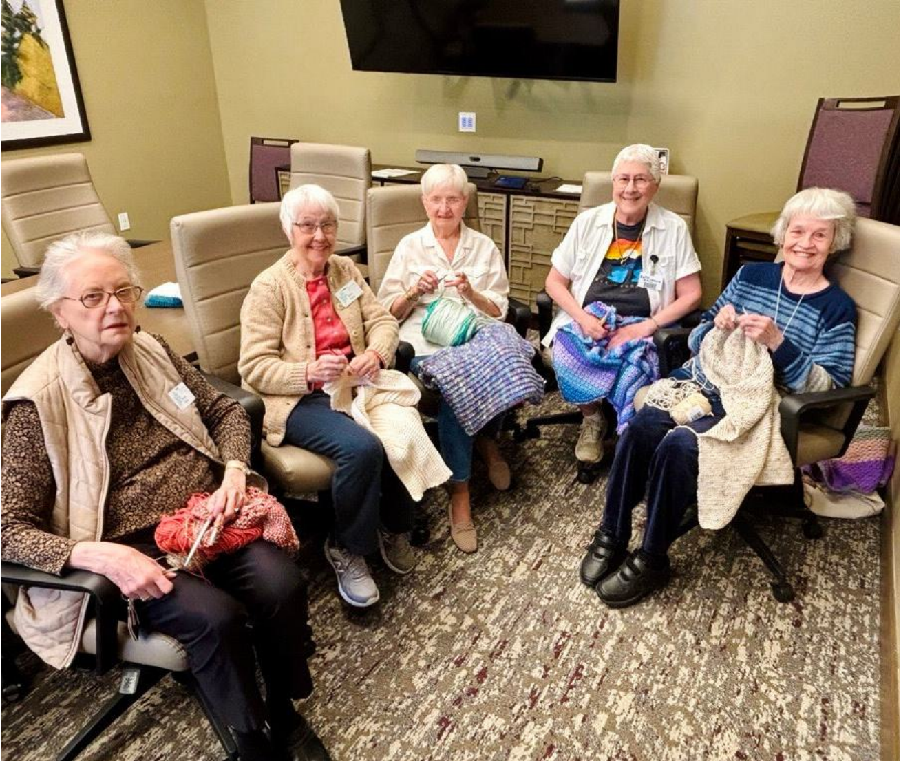
The Charity Knitting & Crochet group at Givens Highland Farms.

Some residents at Givens Highland Farms and Givens Estates are turning fiber arts into a powerful force for connection, creativity, and community service.