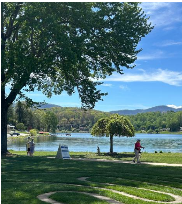
Givens Estates residents visit Lake Junaluska.