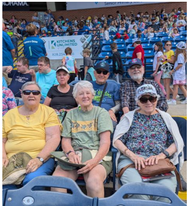
Givens Estates residents at the Asheville Tourists game.