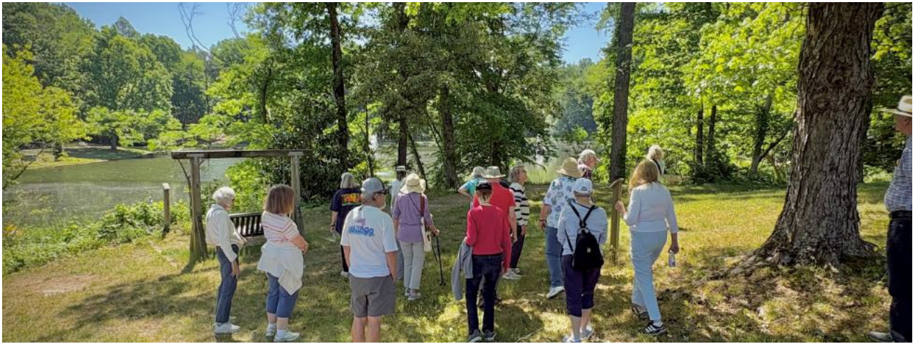
Givens Aldersgate residents enjoy Earth Day with a walk around the lake.