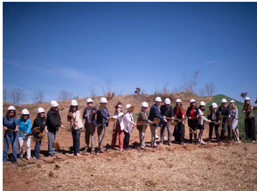
Givens Communities and Henderson County Leaders break ground together at Apple Ridge site.

“At Givens, we see affordable senior housing not as a single project, but as a regional priority,”