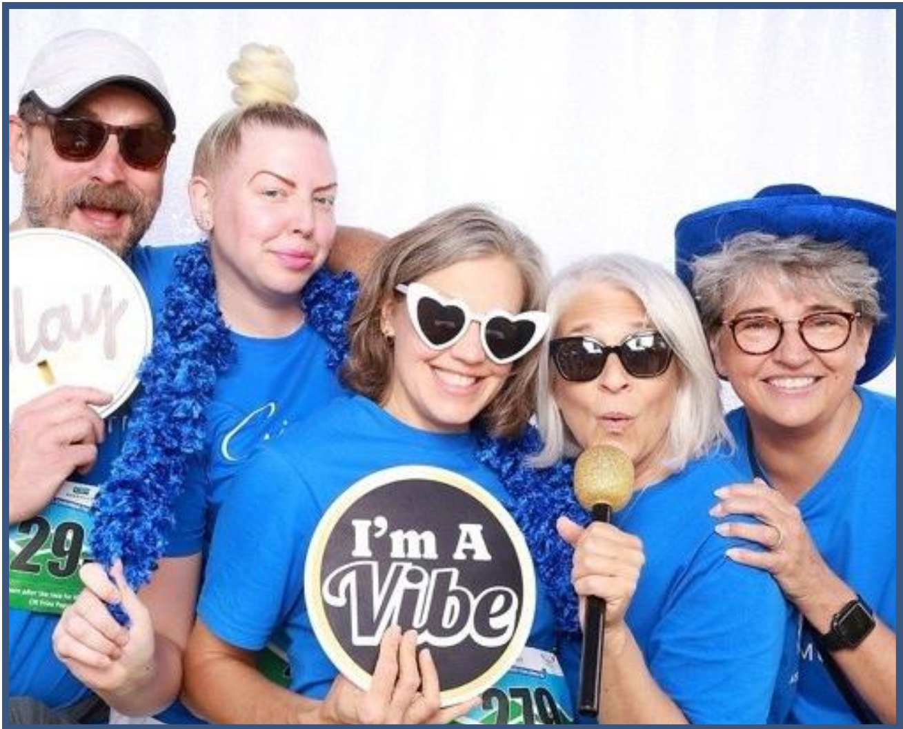
Givens Foundation Team in lighthearted moment at the Asheville Chamber Challenge 5k.

In a major announcement, Givens Philanthropy will now become Givens Foundation – a name that more clearly reflects the vital role in advancing the mission and expanding the impact of the Givens philanthropy team.